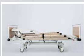
Thigh rest adjustment : 0 - 40°