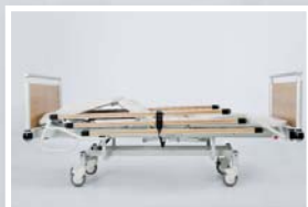
Foot rest mechanical adjustment : 0 - 25°