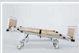
Trendelenburg position : 0 - 12°