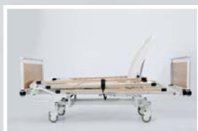
Backrest adjustment : 0 - 70°