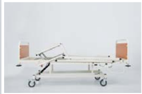
Foot rest mechanical adjustment : 0 - 25°