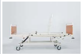
Backrest adjustment : 0 - 70°