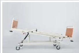
Trendelenburg position : 0 - 12°