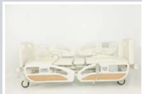
Mattress platform minimum height : 42 cm