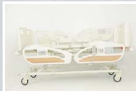
Mattress platform maximum height : 77 cm