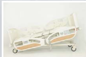
Anti - trendelenburg position : 0 - 12°