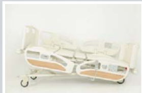
Trendelenburg position : 0 - 12°