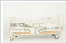
Kneerest movement by motor 0 to 27°