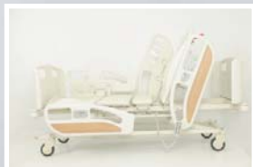
Backrest movement by motor 0 to 68°