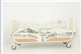
Foot rest mechanical adjustment : 0 - 22°