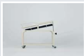
Trendelenburg position : 0 - 14°