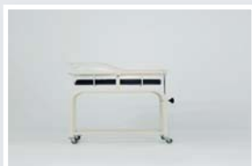
Height : 85,5 cm