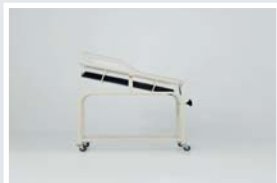
Anti - trendelenburg position : 0 - 14°