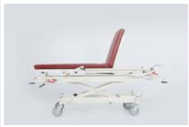
Backrest Adjustment : 0 - 65°