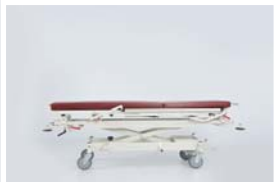
Mattress platform minimum height : 74 cm