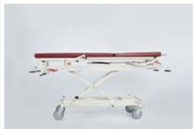
Mattress platform maximum height : 105 cm