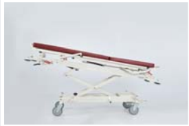
Trendelenburg position : 0 - 12°