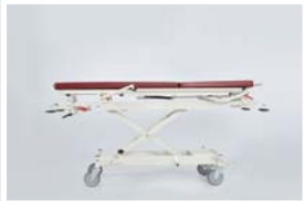
Mattress platform maximum height : 105 cm