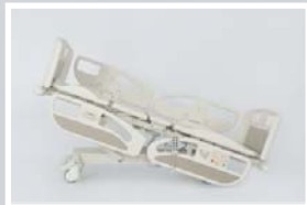
Trendelenburg position : 0 - 16°