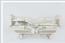
Thigh rest adjustment : 0 - 27°