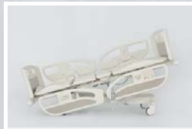
Anti - trendelenburg position : 0 - 16°