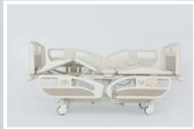
Foot rest mechanical adjustment : 0 - 22°