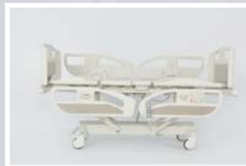
Mattress platform maximum height : 79 cm (150 mm with castor)