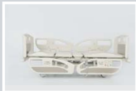
Mattress platform minimum height : 49 cm (150 mm with castor)