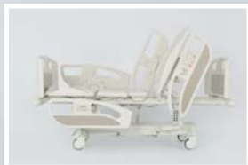
Backrest adjustment : 0 - 68°