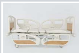
Mattress platform height : 49 cm