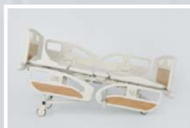
Trendelenburg position : 0 - 12°