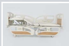
Thigh rest adjustment : 0 - 40°