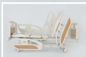
Backrest adjustment : 0 - 70°