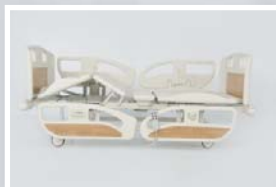
Foot rest mechanical adjustment : 0 - 25°