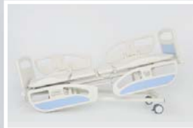
Anti - trendelenburg position : 0 - 12°