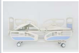
Foot rest mechanical adjustment : 0 - 25°