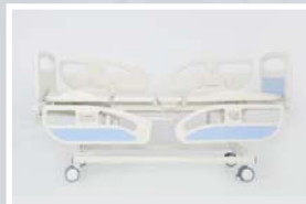
Mattress platform maximum height : 73 cm