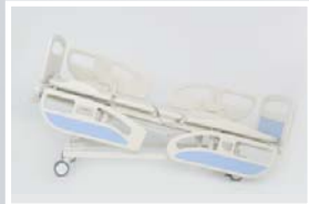
Trendelenburg position : 0 - 12°