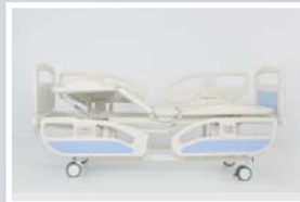
Thigh rest adjustment : 0 - 40°