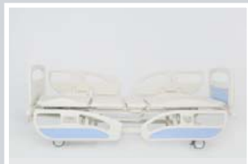
Mattress platform minimum height : 43 cm