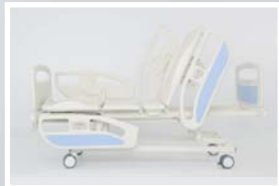
Backrest adjustment : 0 - 70°