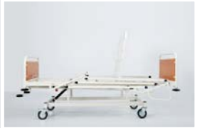
Backrest adjustment : 0 - 70°