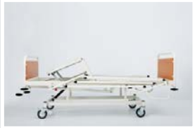
Foot rest mechanical adjustment : 0 - 25°