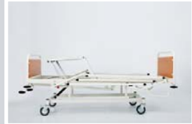
Thigh rest adjustment : 0 - 40°