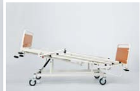
Trendelenburg position : 0 - 12°