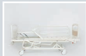
Thigh rest adjustment : 0 - 40°