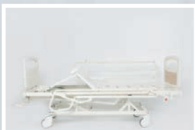
Foot rest mechanical adjustment : 0 - 25°