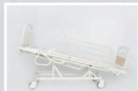
Trendelenburg position : 0 - 12°