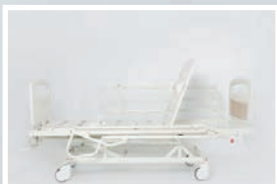
Backrest adjustment : 0 - 70°